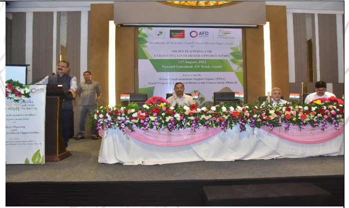
Keynote Address by Shri Chandra Mohan Patowary, Hon'ble Minister for Environment & Forests, GoA