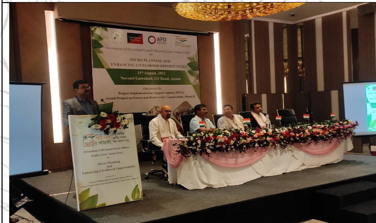
Question and Answer Session in progress