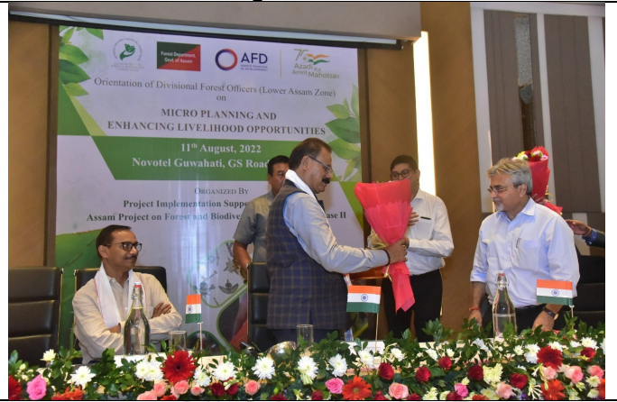
Felicitation of the Hon'ble Minister